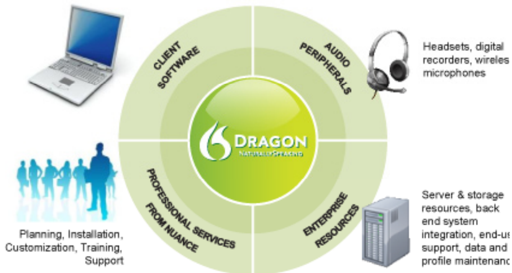
Figure 3: Components of a Dragon Enterprise Installation

In addition, setting realistic expectations has a critical impact on the success or failure of the speech recognition program. While speech recognition enables organizations to automate workflows without disrupting existing processes, there is still a component of change as employees adopt the new technology and transition to the new approach of dictation vs. typing. Professional services can facilitate the change management process, helping to speed and ease the organization's transition and drive higher user adoption rates.