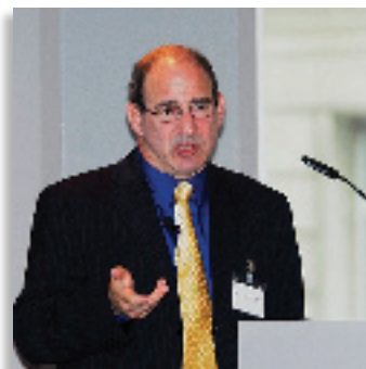
Image 4: Speaking at the partner event A North American first, internationally acclaimed.