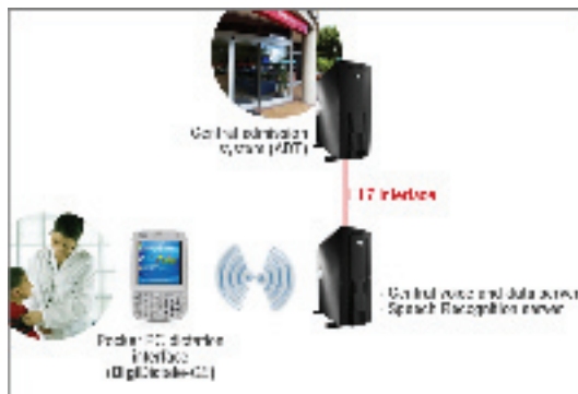
Image 2: Diagram Interfaces between the central admission system, speech recognition server and PDAs.

All recordings are streamed live to the central SpeechMagic server; no information